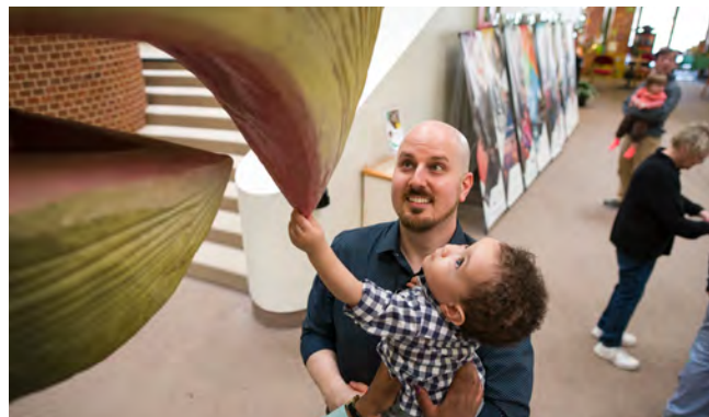
Alden B. Dow Museum of Science & Art

“I have seen many families enter our museum with a sense of hesitation, assuming they won't be able to stay for a visit, unaware that we are a Museums for All institution. As soon as I let them know, I see a sense of relief and a smile.”