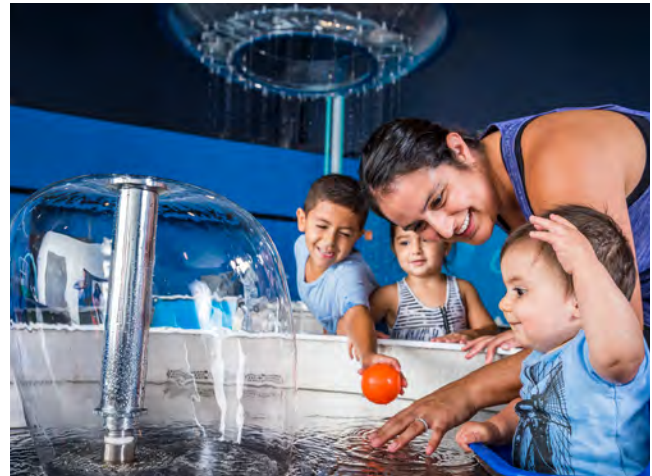
Orlando Science Center

The initiative was launched in 2014 as a strategic partnership between IMLS and ACM, in service to both organizations' strategic goal of providing greater access to museums for all children and families. The initiative was also informed by several research studies from the museum field showing that early access to the informal learning opportunities offered by museums and other cultural organizations leads to positive impact in children's development and academic performance.