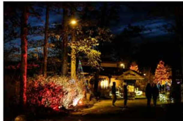
Families check out the Wonderland of Lights at Potter Park Zoo Saturday, Nov. 21, 2020. The event will run Thursdays through Sundays from 5 p.m. to 8 p.m. until Dec. 27 with the exception of Thanksgiving, Christmas Eve and Christmas Day.

For over 25 years, Potter Park Zoo has illuminated itself in a joyous and magical holiday celebration for Lansing residents and others to enjoy. This year in particular, everyone seems to need a little bit more joy, and Potter Park Zoo will not.